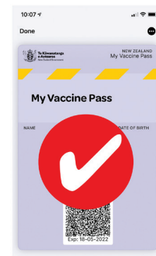
CORRECT Vaccine Pass