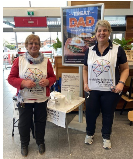
Members of Papanui Rotary at Northwood New World

It was a beautiful weekend, which was such a relief after last year, and the public were incredibly generous.