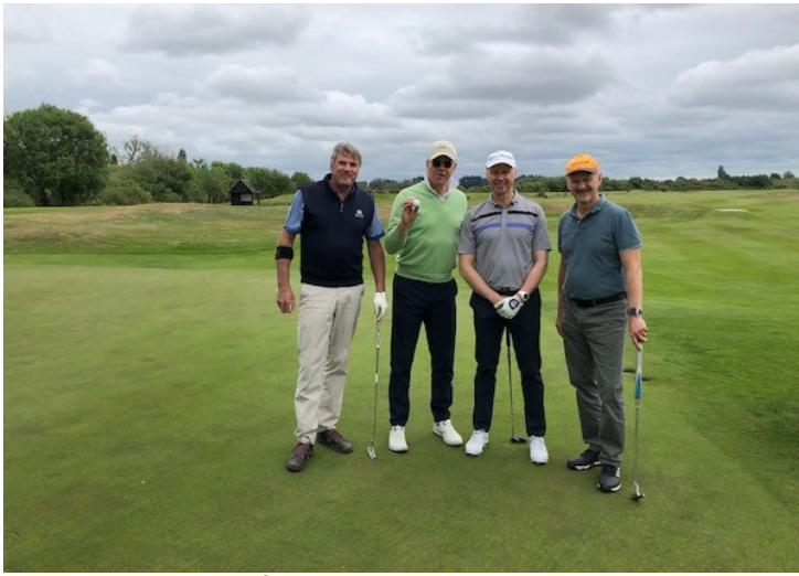
Winning team, from Craig's Investment Partners