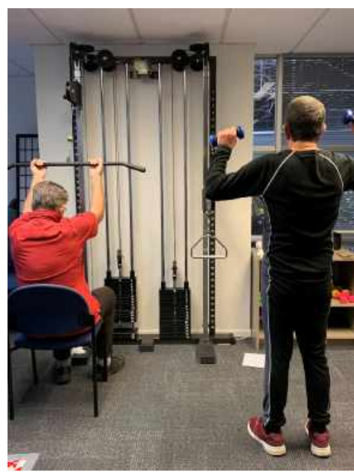
Working out in the Open Gym, June 2020