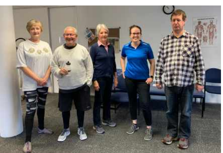
Parkinson's Power: The first class back after Lockdown, May 2020