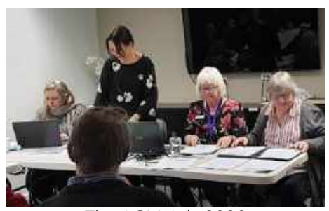
The AGM, July 2020