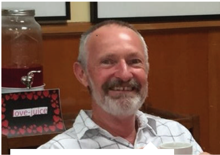
Celebrating Valentine's Day at the MS Lunch