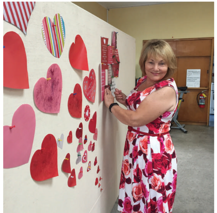
Until the next edition – goodnight!